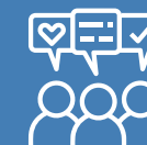
Employer Commitment to Cancer Screening (Poll of Oncology Learning Collaborative Participants)

See what employers are doing with oncology benefits, shown in frequent poll results.