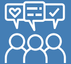
Employer Commitment to Cancer Screening (Poll of Oncology Learning Collaborative Participants)

See what employers are doing with oncology benefits, shown in frequent poll results.