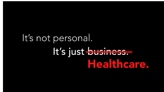
Click on the image above to view the trailer.