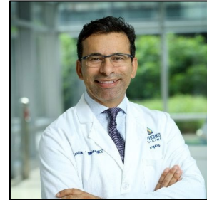
Dr. Marty Makary

You don't want to miss our keynote speaker, Dr. Marty Makary , Johns Hopkins Surgeon, Professor of Public Health Policy at the Johns Hopkins School of Public Health, and New York Times best-selling author of "Unaccountable" and "The Price We Pay: What Broke American Health Care – and How to Fix it," and principal investigator of Improving Wisely , an initiative that advances high value care at a lower cost.