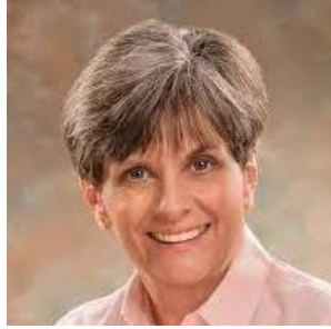
Former Administrator, State of Montana Employee Health Plan